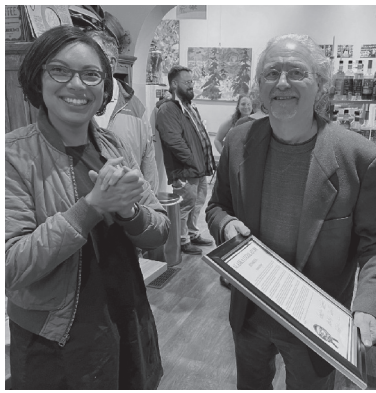
Presenting Sen. Tom Begich with a citation for his dedication to the State of Alaska.

Climate change is real, and we are seeing the effects in Alaska. The only way to slow down or even stop this change is to keep global warming under 1.5 degrees Celsius. To meet this goal, we must move away from burning carbon-based fuels to produce electricity and embrace the use of renewable energy sources like wind, solar, geothermal, and tidal power.