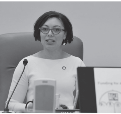
Senator Tobin sitting in Committee.