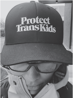
Advocating to protect trans youth at every opportunity.

Climate change is real, and we are seeing the effects in Alaska. The only way to slow down or even stop this change is to keep global warming under 1.5 degrees Celsius. To meet this goal, we must move away from burning carbon-based fuels to produce electricity and embrace the use of renewable energy sources like wind, solar, geothermal, and tidal power.