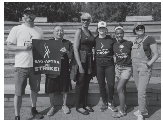
Senator Elvi Gray-Jackson and Senator Löki Gale Tobin standing in solidarity with striking union members.