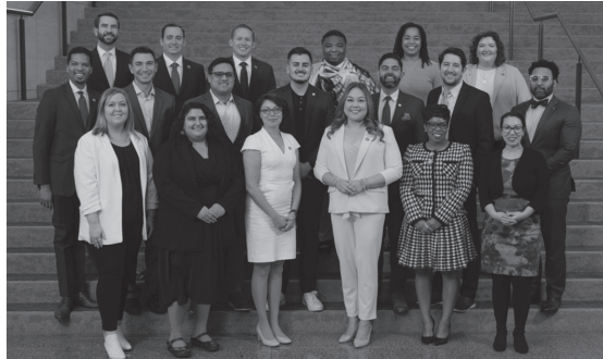
Sen. Tobin and the winners of the 2023 Council of State Governments 20 Under 40 Leadership Award.

To spur this transition, I am sponsoring Senate Bill 101 to set enforceable renewable energy generation targets for the electric utilities that serve the Railbelt. SB 101 and the companion bill in the House, HB 121, call for 55% of the electricity generation in the Railbelt to come from renewable energy resources by the end of 2035. Currently, only 15% comes from renewable energy sources. The target included in both bills is to reach 80% renewable energy generation by 2040. SB 101 and HB 121 have widespread bipartisan support that is most obvious by the fact that the Senate version of the bill is sponsored by me, a Democrat representing Downtown Anchorage, and the House version of the bill is sponsored by a Republican from Wasilla. As a matter of fact, both bills are based on similar legislation introduced last session by Governor Dunleavy.