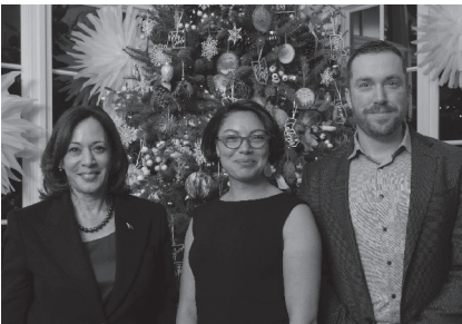
Vice President Kamala Harris, Sen. Löki Gale Tobin, and Walker Gussie during a holiday reception on December 11 at the residence of the U.S. Vice President.

To spur this transition, I am sponsoring Senate Bill 101 to set enforceable renewable energy generation targets for the electric utilities that serve the Railbelt. SB 101 and the companion bill in the House, HB 121, call for 55% of the electricity generation in the Railbelt to come from renewable energy resources by the end of 2035. Currently, only 15% comes from renewable energy sources. The target included in both bills is to reach 80% renewable energy generation by 2040. SB 101 and HB 121 have widespread bipartisan support that is most obvious by the fact that the Senate version of the bill is sponsored by me, a Democrat representing Downtown Anchorage, and the House version of the bill is sponsored by a Republican from Wasilla. As a matter of fact, both bills are based on similar legislation introduced last session by Governor Dunleavy.